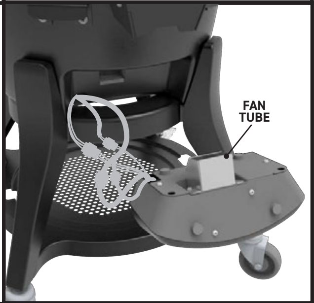
Repeat the steps in reverse order to install the new rear module. *Note - when reinstalling the rear module, be sure the fan tube is fully seated in the grill body.