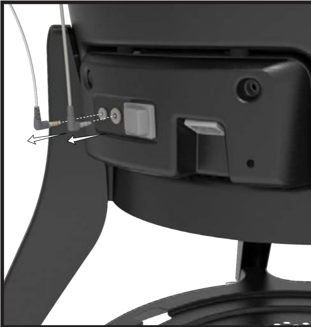
Unplug lid switch, pit probe, and power supply.