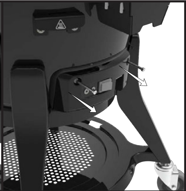
Loosen two screws from rear module. Please note, the screws do not have to be fully removed to disengage the rear module.